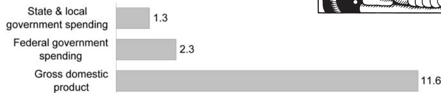
Government spending and GDP in 2004 (in $ trillions)

The public sector also generates a lot of jobs. In 2004, national, state, and local governments employed more than 23 million people, or about 16% of the workforce. Public employment often provides women and people of color with better job opportunities than the private sector does.